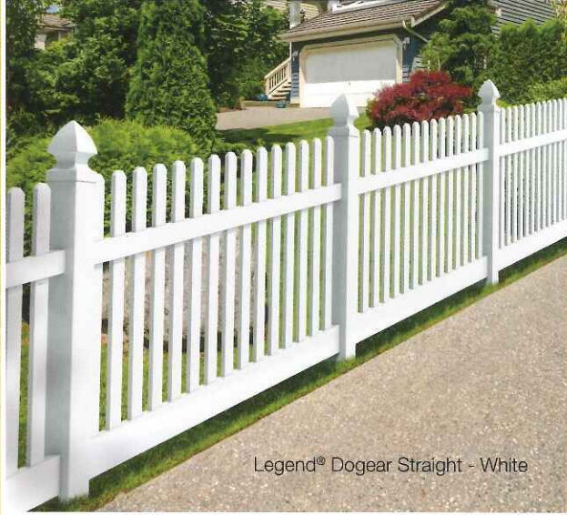
Legend ® Dogear Straight - White