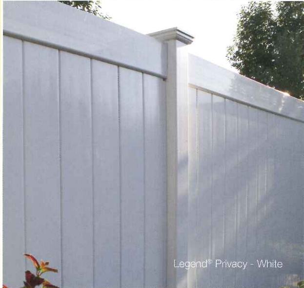
Legend ® Privacy - White